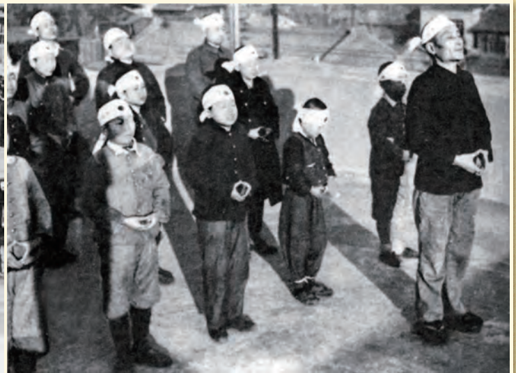
If representative Christian groups had united among themselves, Korea could have asserted Adamic authority, protected her citizens and prevented Satan from inciting Imperial Japan to acts of armed aggression and religious persecution. Right: Koreans worshipping at one of 1,141 Shinto shrines built in Korea; Left: Korean schoolchildren compelled to pledge allegiance to the Japanese emperor

not to have sexual relations; the son did not obey his mother, however, and lived as a husband with his wife—and as a result, his wife was taken to the spirit world. In those days, this old woman did not explicitly understand the principle of indemnity, but because her husband had persecuted her so severely, she thought she had to atone for her husband's behavior.