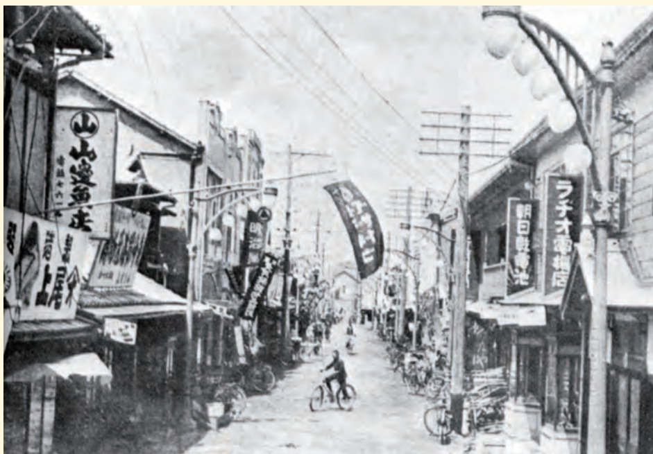
Wonsan is a port city on the east coast of what is today North Korea. The photo shows a Japanese shopping area in downtown Wonsan during the occupation.

The east and the west halves of the Korean Peninsula have distinguishing characteristics. The east is mountainous; the west is dominated by plains. The east side of the country is masculine, whereas the west displays a feminine aspect. God's providence, too, has characteristics similar to the geographical features of the Korean Peninsula. In other words, God's providence for the east half had masculine characteristics, while in the west, it had female characteristics. In the west, in Cholsan, women were doing spiritual activities, while in Wonsan, which is in the east, men were doing practical activities.